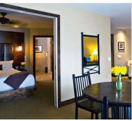
SUITES & STUDIOS