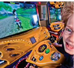
NEW GAME ROOM