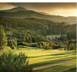
PREFERRED TEE TIMES