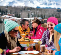
NEW PALMYRA DECK