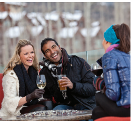
NEW GREAT ROOM DECK